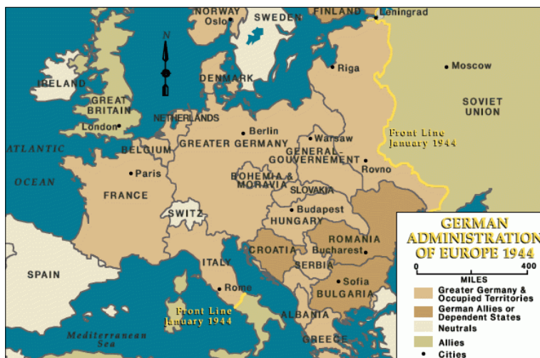
United States Holocaust Memorial Museum

Including multimedia components in your Holocaust instruction has many benefits, including facilitating comprehension for English language learners and students with learning differences. Audiovisual testimony is also an effective way to highlight the experiences of survivors for all students.