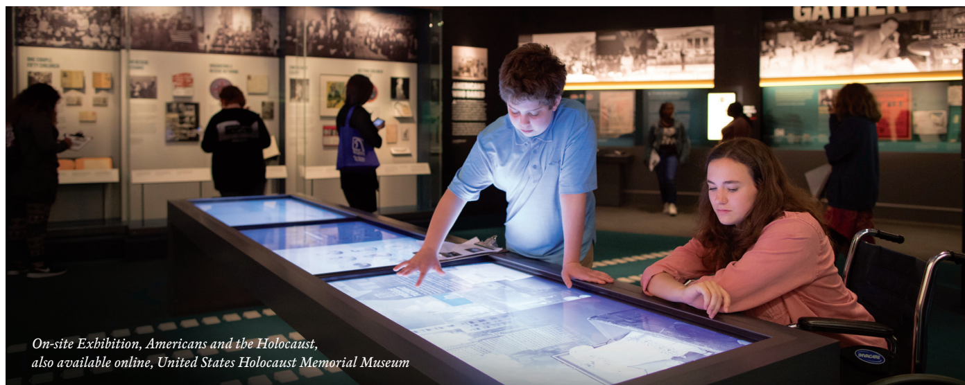
On-site Exhibition, Americans and the Holocaust, also available online, United States Holocaust Memorial Museum