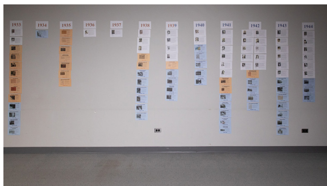
The Timeline Activity, United States Holocaust Memorial Museum