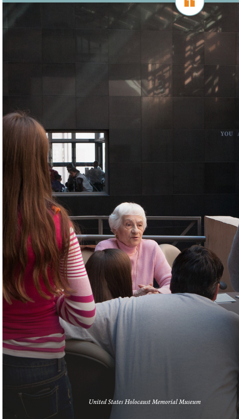
United States Holocaust Memorial Museum